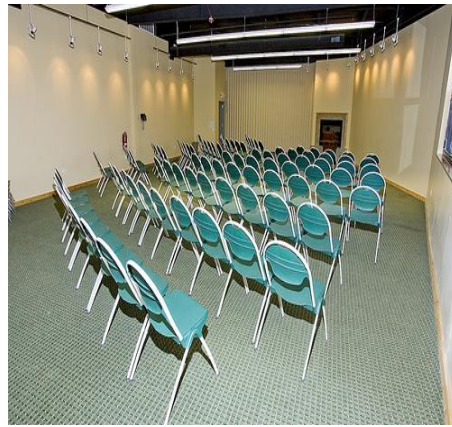
Titus Conference Room

To experience Riverwoods, please call for a tour of our facility.